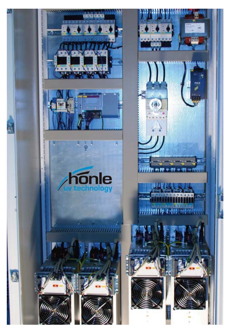
Sun simulation switch cabinet

The high efficiency and long lifetime of the Hönle metal halide bulbs makes solar simulation with SOL units economically attractive. They can be integrated into climate test cabinets and chambers as well. Thus, multi-parametric tests can be done. The units can be fixed outside the climate chamber and radiate through high-grade filter glass into the testing room. High quality filter glass protects the SOL units from humidity and temperatures from inside the chamber, and avoids undesirable interaction between the bulbs and external contaminants. By simply adding another glass filter, outdoor irradiation can be changed to indoor irradiation (or vice versa).