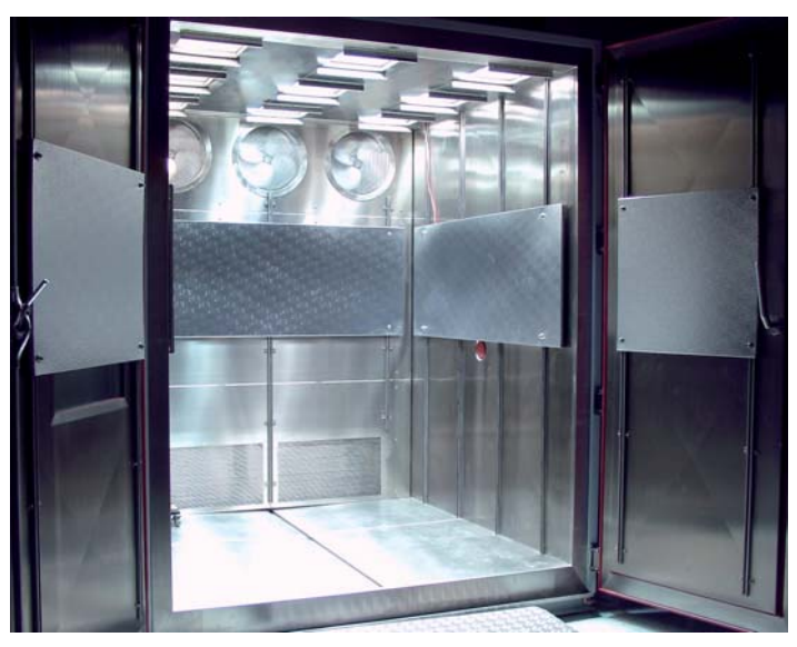
Climatic chamber with 9 SOL 2000 units

Special metal halide bulbs produce the light spectrum. Metal halides hermetically sealed inside the bulb are vaporised by an electric arc and generate a spectrum, which is close to that of natural sunlight. SOL units do not produce ozone .