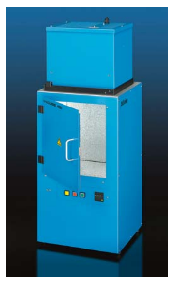
Sun simulation chamber UVACUBE 400

Alternative filters are available which can vary the spectrum to suit users needs.