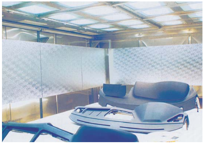
Climatic chamber with 24 SOL 1200

Beside conventional ballasts you can also use electronic power supplies (EPS) made by Hönle. These EPS supply the lamp with a rectangular current that improves the performance of the luminous flux. Thus, the power output increases by approx. 10%.