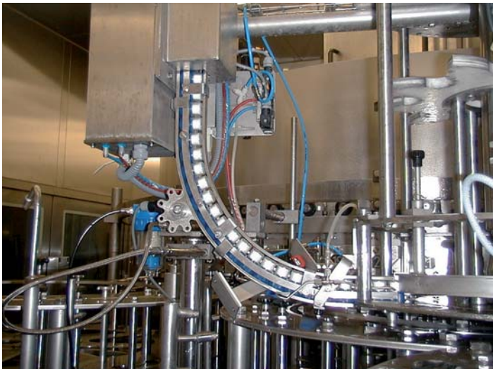
UVATEC used for the disinfection of screw caps in the beverage industry