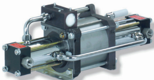
DLE 2 double acting, single air drive head single stage